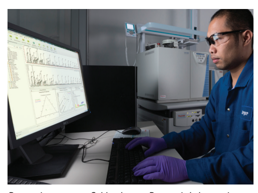
Reservoir experts at Schlumberger Reservoir Laboratories around the world use Malcom software to process chromatography data, perform statistical calculation, and deliver fast data interpretation.

Combining production allocation and reservoir connectivity (PARC) workflows, the Malcom PARC module helps discern reservoir fluid differences based on indexation and calculation of interparaffinic peak ratios. When coupled with laboratory analysis, this module provides greater certainty in evaluating the differences between similar fluids of every origin. Applications include assessing changes in commingled production streams for back allocation, quantifying inputs from end-member reservoir fluids, and providing complementary information for complex reservoir continuity and gradients studies.